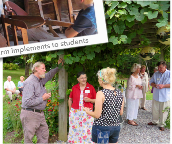
Summer Party at Pownalborough Court House