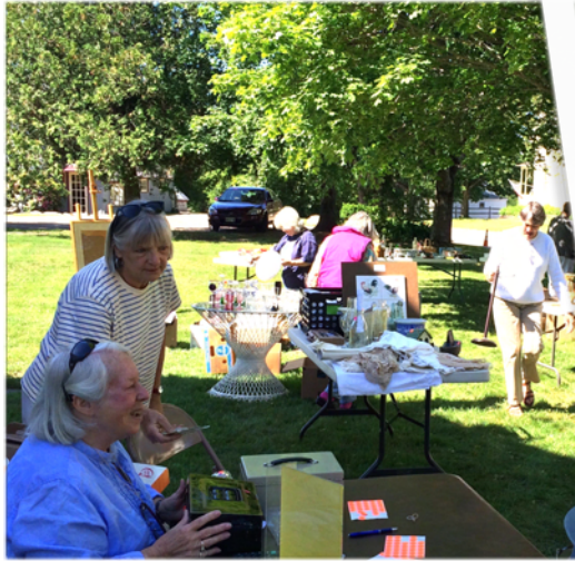
Yard Sale at the Old Jail